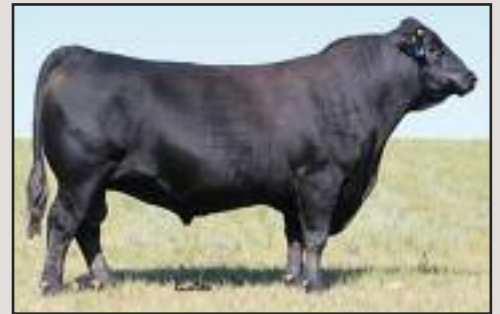
KG High Regard