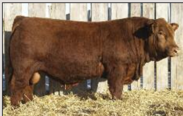
MRL Ringman – Sire of Lot 29

A nice, performance bull here that should increase your weaning weights. He ranks in the top 4% for WW EPD and top 15% for YW and MWW EPD. Homo polled, solid red non diluter. Frame score 6.4. Scrotal 35cm.