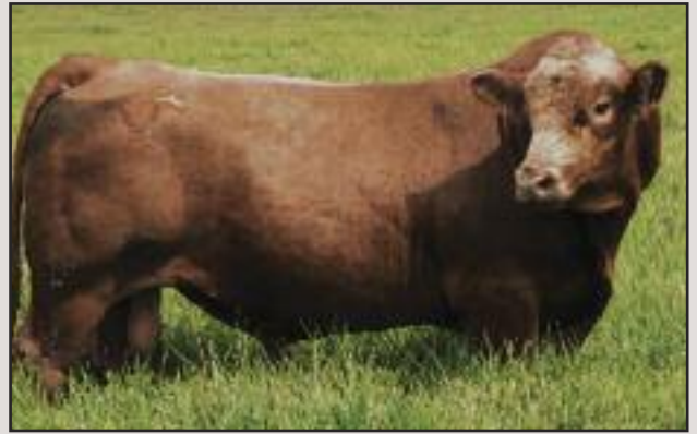
TRAXS Deadwood – Sire of Lots 1 & 2

A nice, homo polled, solid red non diluter out of a powerful cow family with his Gunner dam having a weaning weight ratio of 115 on her 5 calves. Frame score 6.3. Scrotal 34cm.