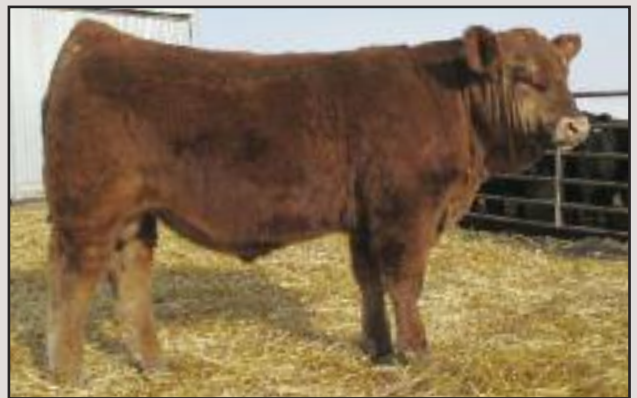
JBS MR Pace 010B – Sire of Lots 10 & 11

An outcross performance bull that had a 103 weaning weight ratio with EPDs that rank him in the top 2% for WW and the top 3% for YW & MWW. Homo polled, solid red non diluter. Frame score 6.6. Scrotal 39 1/2cm.