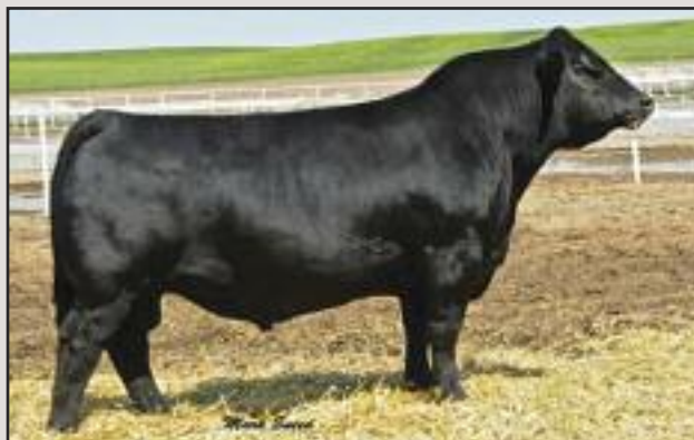
MR NLC Upgrade – Sire of Lots 7 & 8