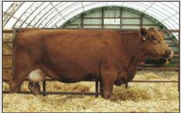
Ankony Miss Candace – Dam of Lot 20 Pictured at 11 years of age.

Black Gem is a product of some embryos I bought from Hilltop Simmentals. You won't miss him on sale day. His WW EPD ranks him in the top 15% and YW, MWW EPDs in the top 10%. Homo black hetro polled. Frame score 6.7. Scrotal 35cm.